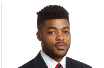
0 FRANK MASON III Sr. • G • Petersburg, Va.