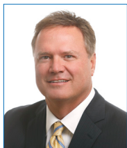
BILL SELF Head Coach 14th Season